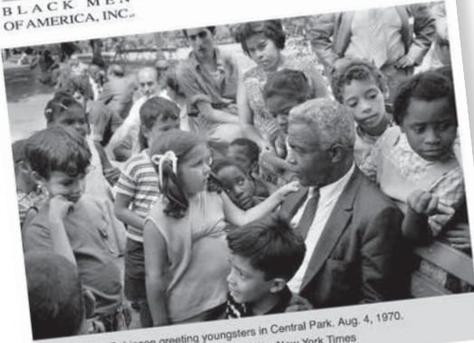
Robinson greeting youngsters in Central Park. Aug. 4, 1970.

Yesterday marked the Centennial birthday of our Legendary Leader Mr. Jackie Robinson. Watch Video: Jackie Robinson - a trailblazer who changed America. A new exhibit at the Museum of the City of New York marks his 100th birthday.