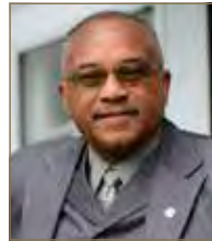
Dr. Tommie Smith U.S. Olympic Gold Medalist 100 Black Men of The Bay Area