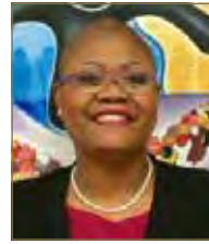
Melanie Campbell CEO of the National Coalition on Black Civic Participation