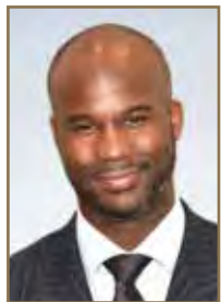
Kolarele Sonaiké International