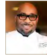
Chef G. Garvin Celebrity Chef Chief Culinary Advisor SodexoMAGIC