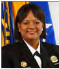
Dr. Regina Benjamin Physician Retired Surgeon General