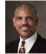
Arnold Donald Chief Executive Officer of Carnival