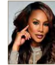
Vivica A. Fox Actress, Producer, Television Host & Entrepreneur