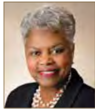
Virginia W. Harris National President National Coalition of 100 Black Women, Inc.