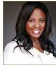
Sope Aluko Actress, TV and Film, Including Black Panther