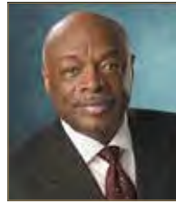
Honorable Willie L. Brown Chairman & CEO Willie L. Brown, Jr. Institute on Politics & Public Service Former San Francisco Mayor